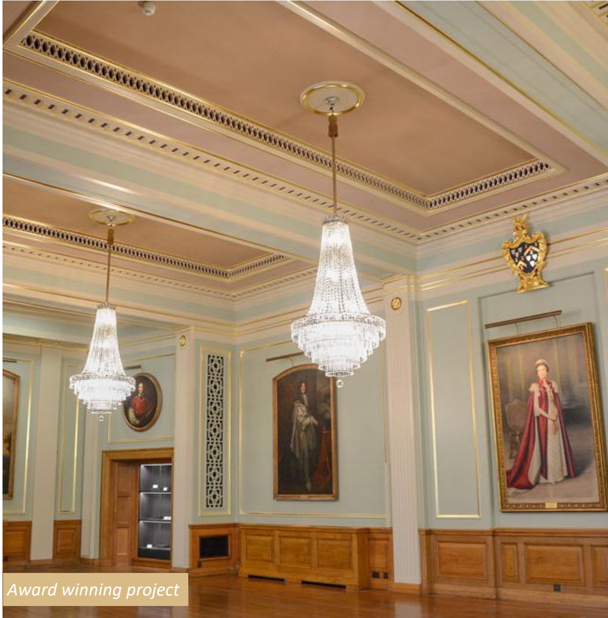
Award winning project

Our Heritage Division won the coveted Premier Trophy, awarded by the Painting and Decorating Association (PDA) for this restoration.